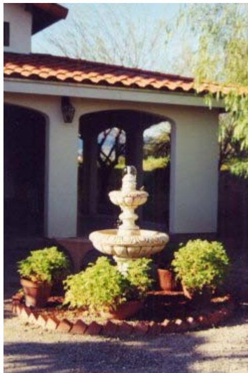
Jyoti Mandir at Desert Ashram

Thank you for your interest and support. Your email address is confidential and will not be shared with any other individuals, groups or businesses. If you prefer not to receive our eNewsletter you can click here to unsubscribe .