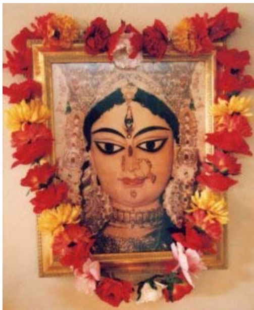
Navaratri celebration, Desert Ashram