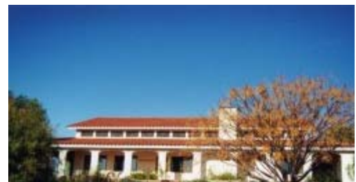
Iyoti Mandir at Desert Ashram