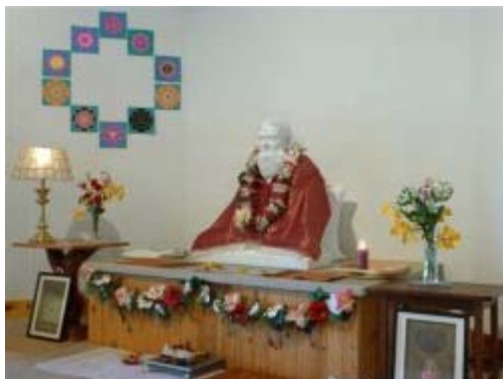
Navaratri celebration. Sacred Mountain Ashram