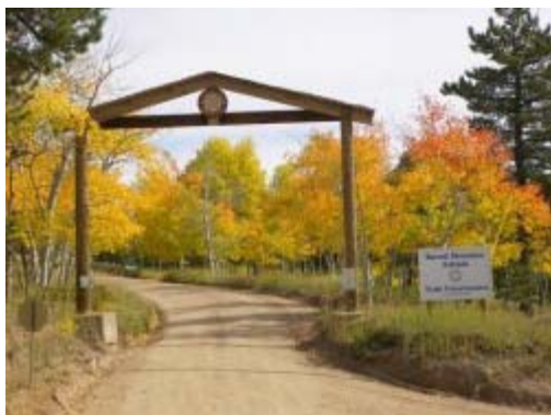
Entrance to Sacred Mountain Ashram