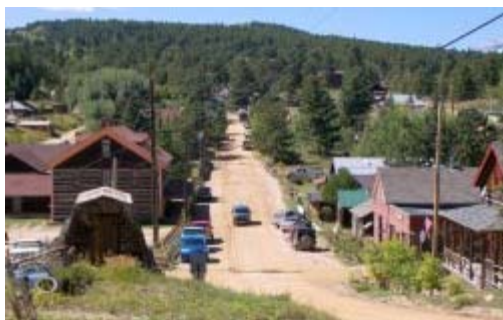
Historic Gold Hill Village near Sacred Mountain Ashram