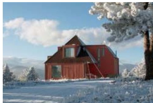
Jyoti Dham—Abode of Light. Gurudeva's cottage, Sacred Mountain Ashram