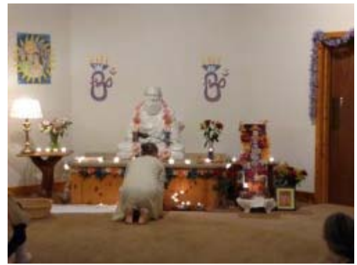
Devotee at Diwali celebration, Sacred Mountain Ashram

Your true Self dictates, not your ego or selfishness, because that will degrade you. Whatever your inner voice, your Spirit and your conscience