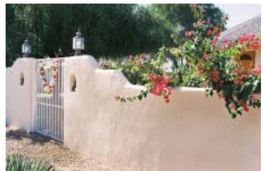
Jyoti Dham, Desert Ashram