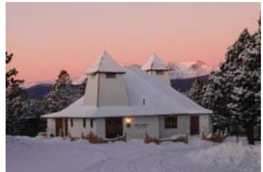
Jyoti Mandir— Temple of Light, Sacred Mountain Ashram