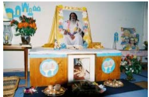
Diwali celebration, Desert Ashram